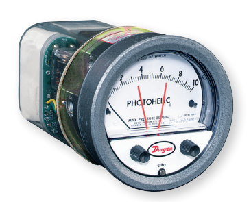
Set points are instantly adjusted with front knobs